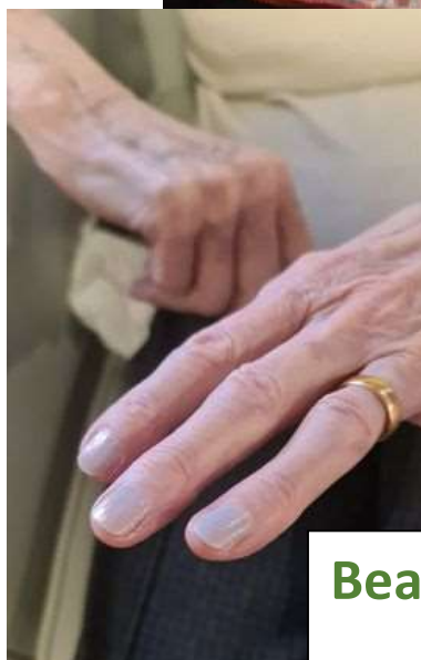
Beautiful nails ladies