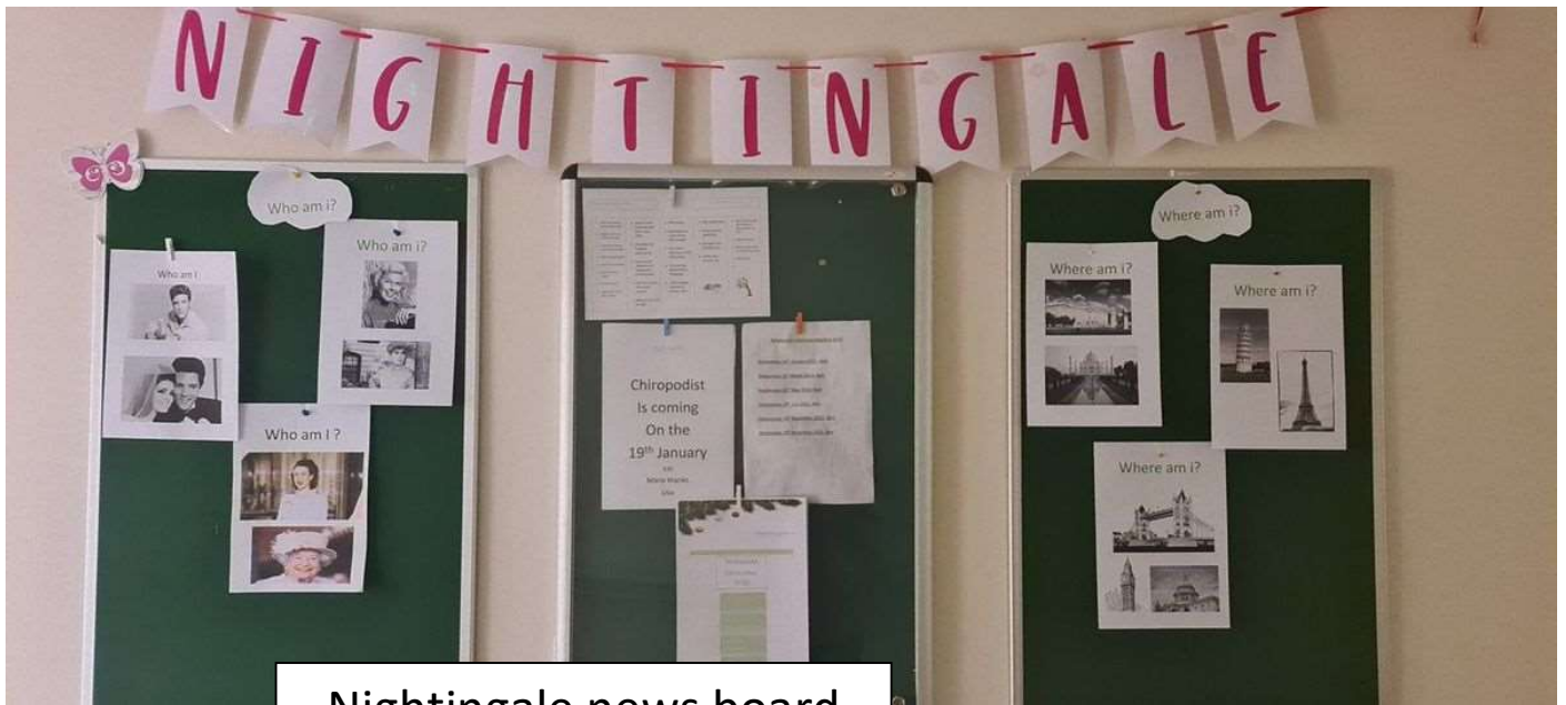
Nightingale news board